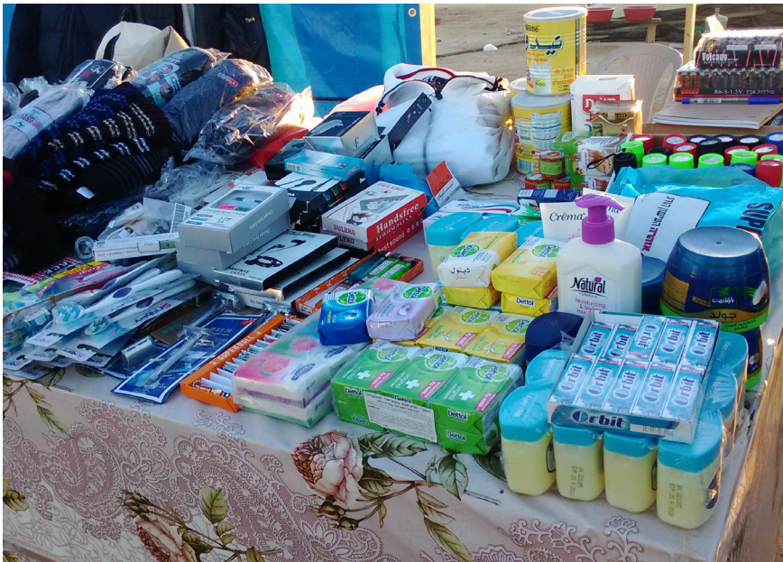
Detainees in Holot selling hygienic products outside Holot facility

This response is illogical considering that throughout the year, over 16,000 people entered and were removed from the facility, the vast majority after a short period, sometimes after just a few hours. It is not logical to provide all these supplies to migrants, the vast majority of whom will be on a plane back to their home countries within hours. Indeed, none of the five interviewees at Yahalom received the “detainee package,” as described in the authority response, despite the fact that they were there between four and eight days. All five interviewees noted that the sheets on the bed were used and dirty, and that they did not receive all the hygiene products or a change of clothing. An American couple requested soap and both received shampoo. The American couple, who were detained for four days, requested their suitcase several times and were told that it would be brought to them – but that only happened when they were already leaving the country.