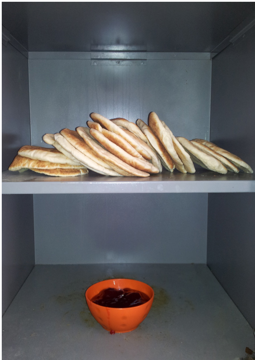
Food reserved by detainees in Holot facility