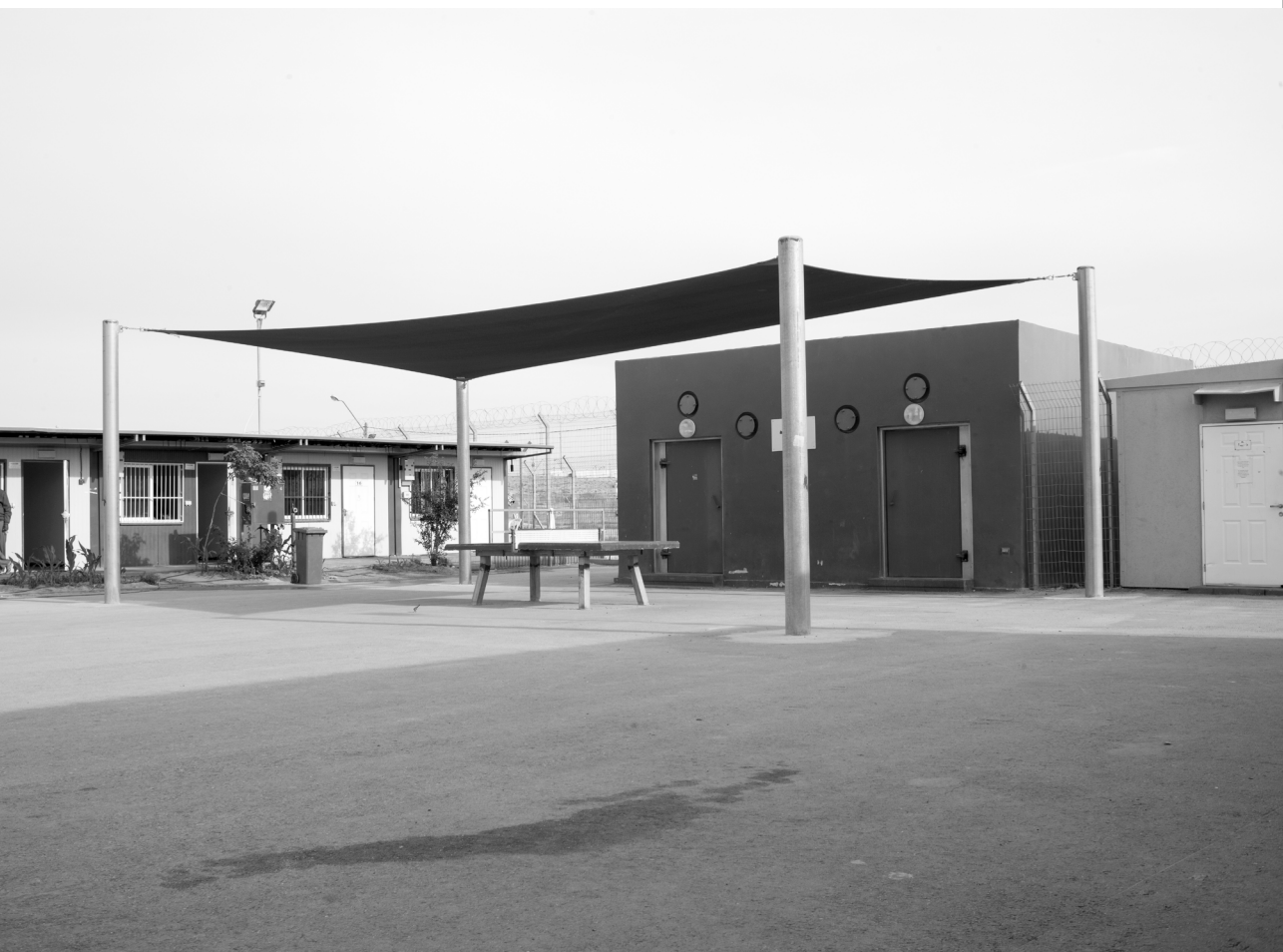
Inside Holot facility

The detainees in Yahalom are rarely permitted to spend time in the yard due to a lack of guards. They are held isolated in their rooms and there is no public common area.