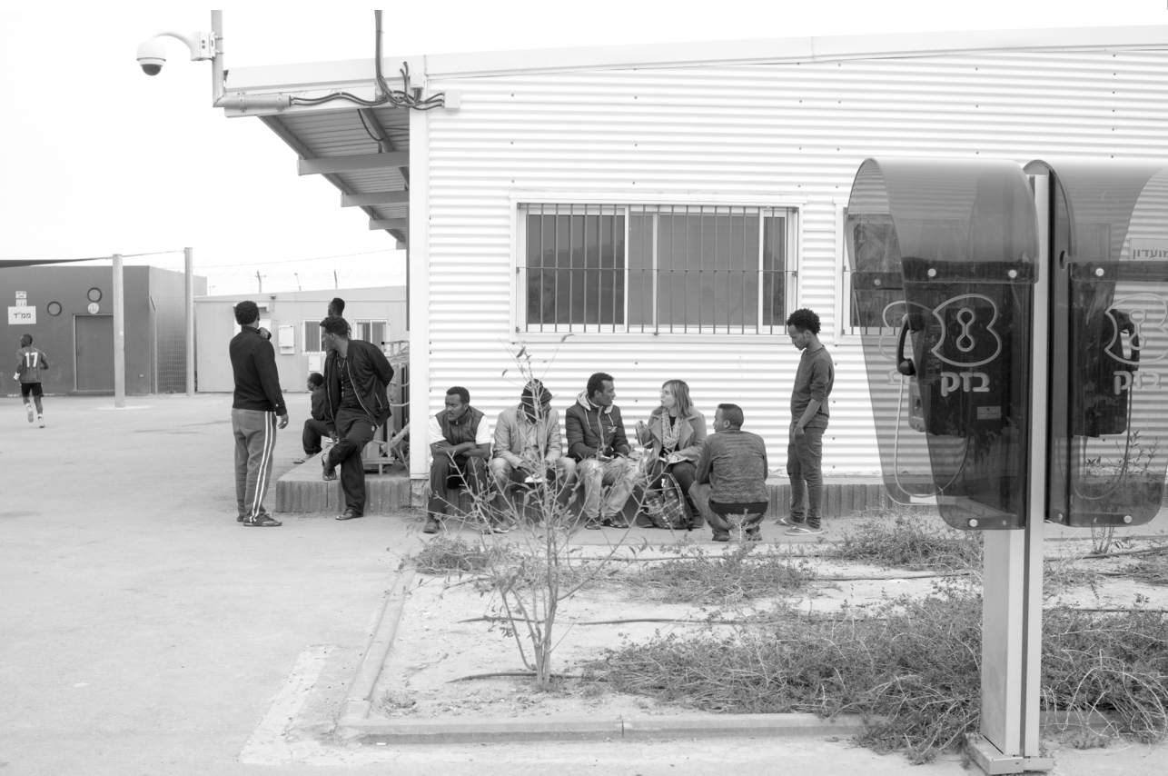
HRM's activist with detainees in Holot

It should be noted that only 10 percent of those interviewed are women, and they were all held in the Givon Prison. The low number of female interviewees can be explained by the fact that in 2016, Saharonim and Holot were male-only detention centers. Women have not been detained in Saharonim since 2013 while Holot is strictly for men. Of the nine women interviewed for the report, two women arrived in Israel from the Ivory Coast, two from the Ukraine, as well as Sri Lanka, Philippines, Nigeria, India and South Africa. Four of the women interviewed for this report are migrant workers from Eastern Europe or Southeast Asia who were arrested because their visas expired. The women from Africa arrived as tourists or asylum seekers and overstayed their visas. The two women from the Ivory Coast who came as asylum seekers during the violent conflict there, have been detained for over four years since they refuse to return to their home country.